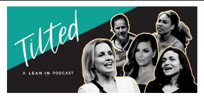
Tilted: A Lean In Podcast leanin.org/tilted