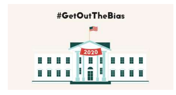
Challenge gender bias in elections leanin.org/2020