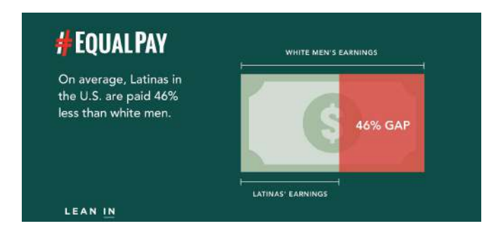
Raise awareness of the pay gap <u>leanin.org/equal-pay</u>