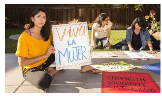
Power of peer support: Lean In Circles leanin.org/Circles