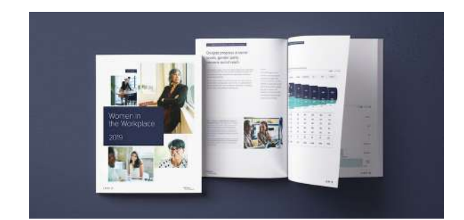
Research: Women in the Workplace leanin.org/women-in-the-workplace-2019